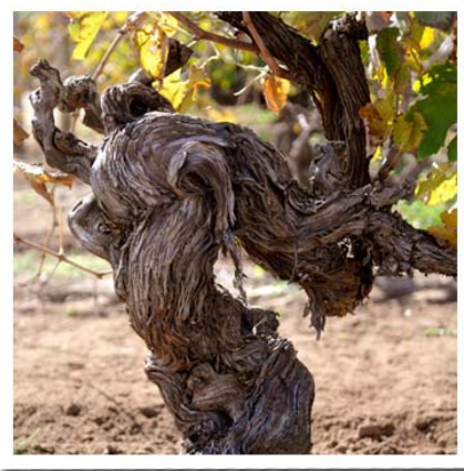
140 year old Shiraz Vine, Langmeil Winery, Tanunda