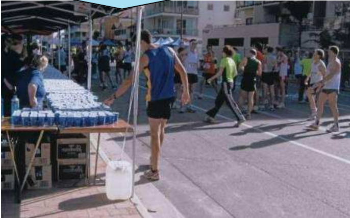
One of our club's major annual events is servicing a drink stand in the plus twenty 12km Adelaide to Bay Fun Run.

The 2008 Fundraising Event has 5 sections -12km run (10,023 entrants) 12km walk (2,419) 6km run (8546) 6km walk(3149) and 18 wheelchair participants. Total 24,155 participants.