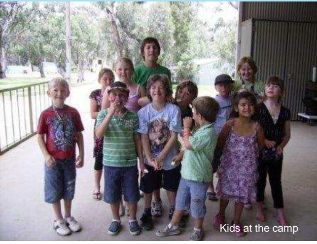
Kids at the camp