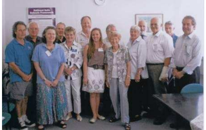
Above: Three of our members were hosted by the Pasadena High School in November 2008. This was a Presentation of Appreciation for our club's on-going financial assistance for the Pasadena Unit Program. This unit provides special education to children in need. One of their services is a bus for the children. We provide assistance with maintenance and registration.